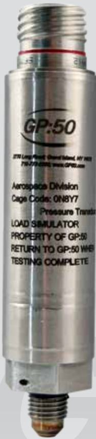
Model 7200 Flight Heritage Pressure Transducer