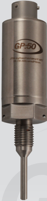
Model 7800 Temperature Transducer