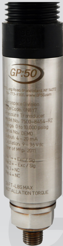
Model 7500 Sub Sea Pressure / Level Transducer