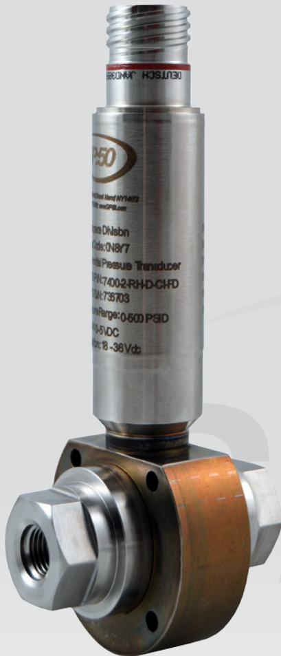
Model 7400 High Line Aerospace Differential Pressure Transducer