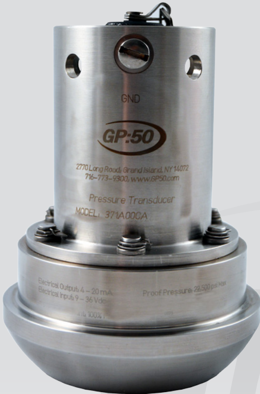
Model 271 / 371 WECO® "Hammer" Union Temperature Transducer