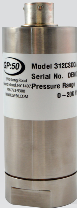
Model 112 / 212 / 312 Ultra High-Pressure Transducer