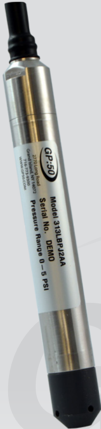
Model 313L Submersible Level Transmitter