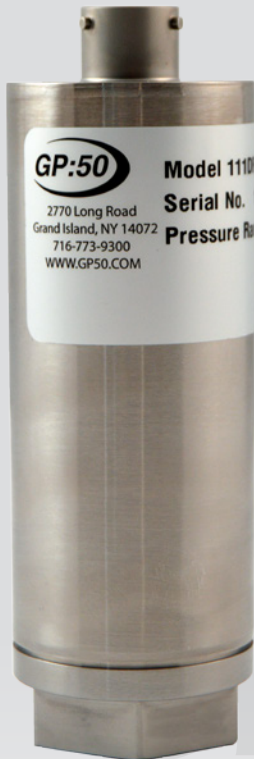
Model 111 / 211 / 311 Industrial Grade Pressure Transducer