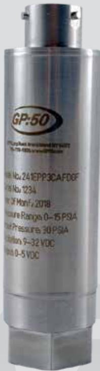
Model 241 / 341 High-Accuracy Pressure Transducer