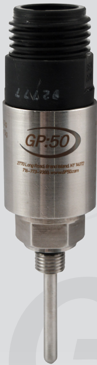
Model 7850 Sub Sea Temperature Transducer