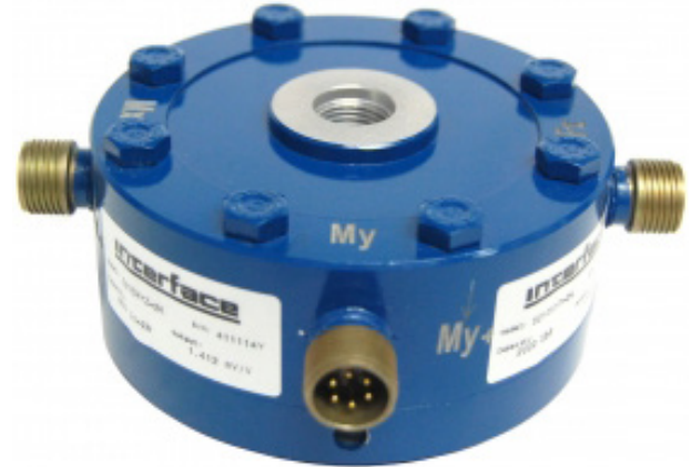
Model 5200 (shown)