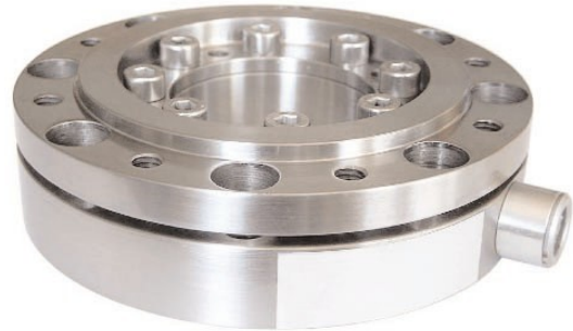
TS19 Short Flange Style Reaction Torque Transducer